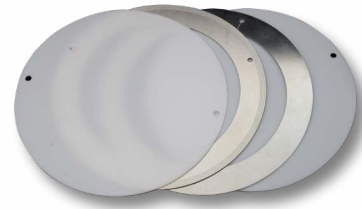
Nexa diaphragm kit

Knowing the importance of keeping processes running smoothly and efficiently, we support end users and operators with real-time quotations for spare parts. We're able to offer extremely short lead times courtesy of a stockholding of 2,000 kits and components at our central warehouse.