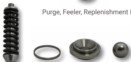
Nexa XP Spring, Valve Kit