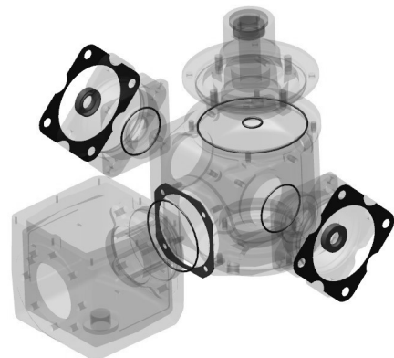
Mechanism Gasket Kit

Our vacuum packaging allows the customer to make an immediate visual check on the integrity and quantity of the parts while preventing quality degradation and ensuring long shelf life.