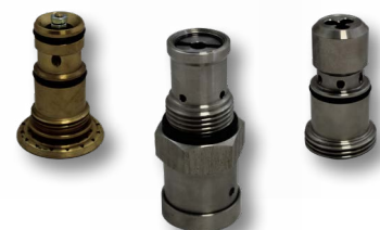
Purge, Feeler, Replenishment Kit

Whether your pump requires quick maintenance or full-service repair, Exakta's customized kits conveniently provide all the parts you need for an immediate fix.