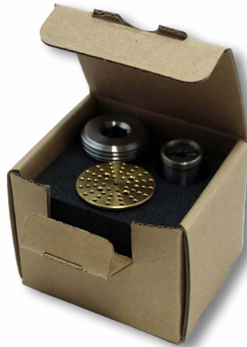
Spare part Kit Purge

Prior to shipping, each part is duly inspected to meet quality and certification requirements while special components such as valves come factory pre-set to fulfill the same performance and criteria as the original product and ensure consistent operation.