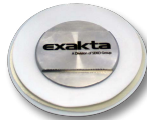
Nexa XP diaphragm